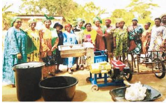
ASSOCIATION WOMEN LEADERS of the Littoral - Cameroon